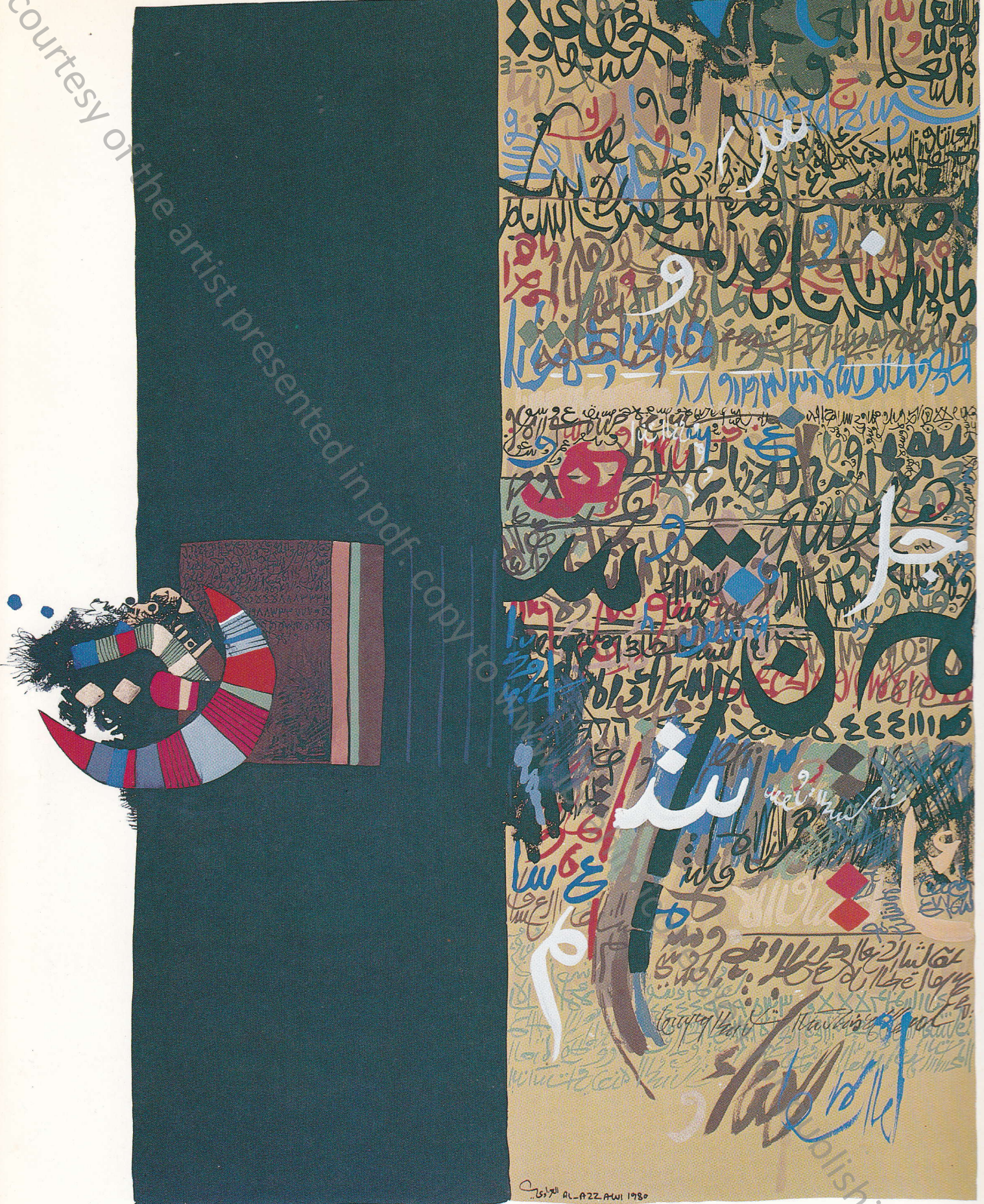
Manuscrit Gouache 64 x 85 cm 1980

courtesy of the artist presented in pdf copy to