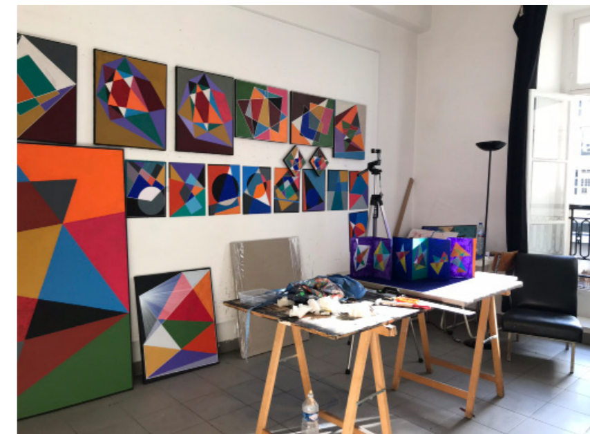
Adhafera 'The Braid/Strand of the Lion's Mane' Acrylic on canvas 35x25cm Paris 2018